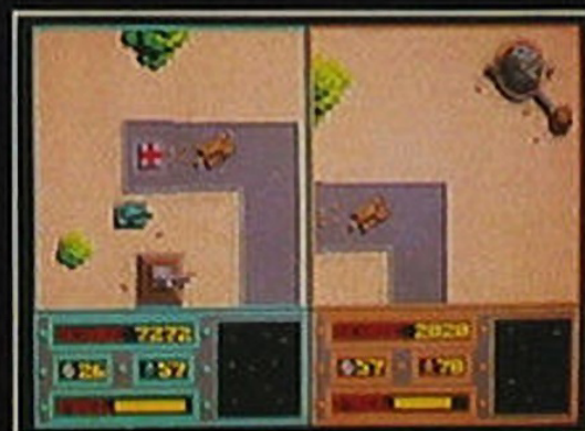
Rescue mission completed.