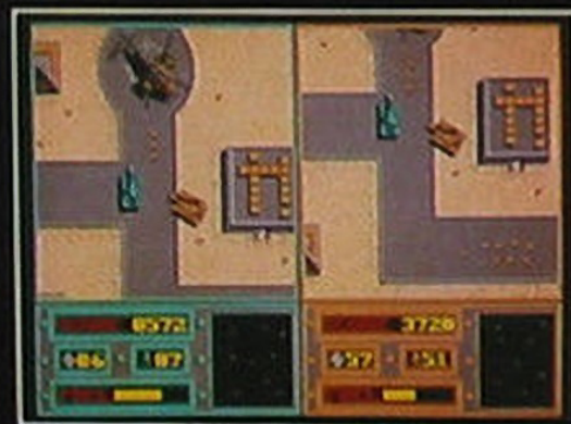
Get your opponents Helicopter before it gets you.