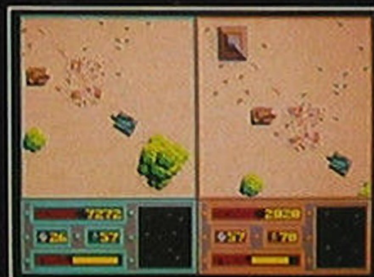
Blood on the field.