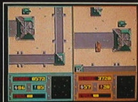
Capturing the flag.