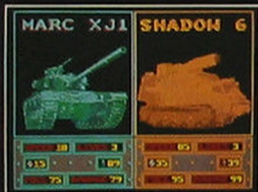
Multiple Tank Selections.