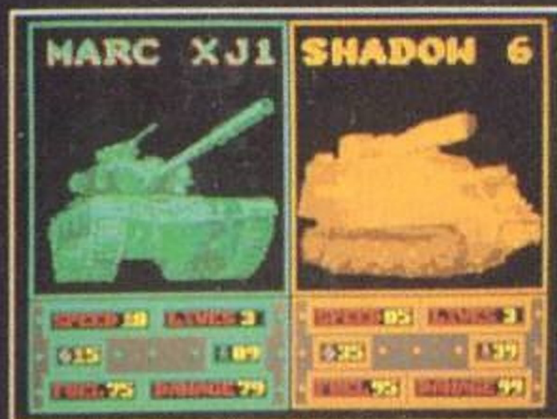
Multiple Tank Selections.

ONE TO ONE PLAYABILITY - One to One playability is a special and unique feature of all Microillusions One to One Series products. With the split screen mode, One to One Series allows you to play against another person or a computer generated opponent. Another unique feature is the ability to play One to One Series games over modems, in this mode as shown below, you have full communication with your opponent while playing the game.